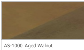
AS-1000 Aged Walnut