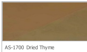
AS-1700 Dried Thyme