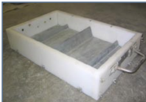
Rectangular Mold with Center Stress Riser and Two Restraints

Twelve concrete mixes were formed for each study (six with and six without fibers). The mix design used for each study is outlined below in Figure 1. All samples were prepared by Stork Twin City Testing Corporation personnel at Stork's facility in St. Paul, Minnesota.