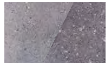
MIDNIGHT BLACK DSL-7010