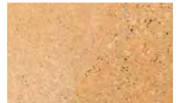
BURNT SIENNA DSL-4210