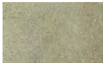
FOREST GREEN DSL-6710