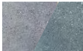
PATRIOT BLUE DSL-5510