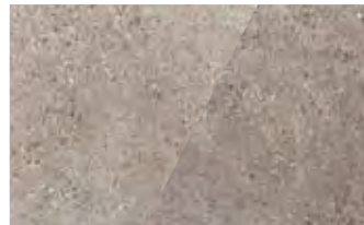
DEEP WALNUT DSL-4010