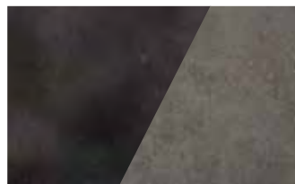
PATRIOT BLUE DSL-5510